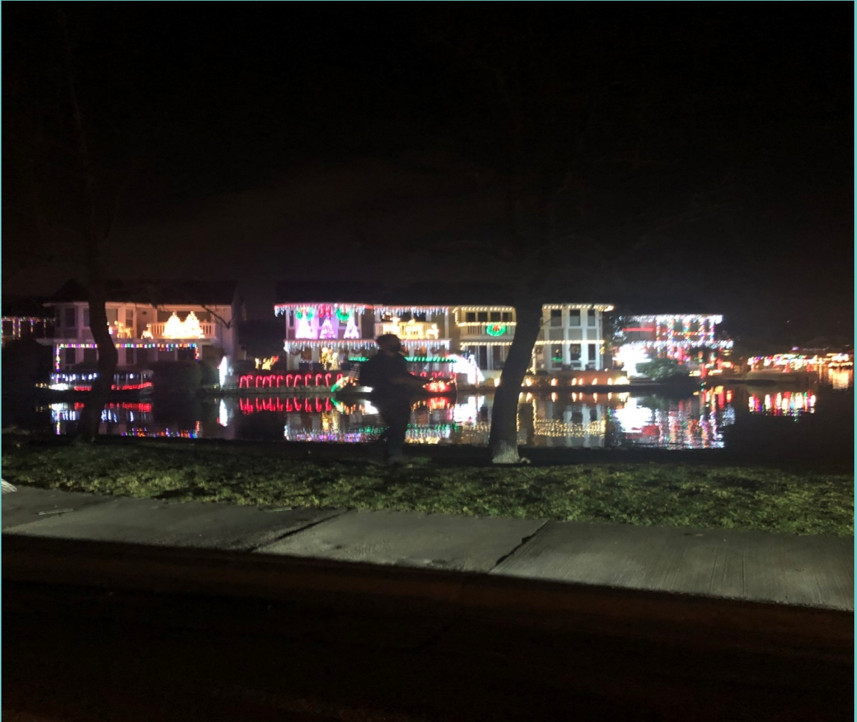
Yorba Linda East Lake Homes